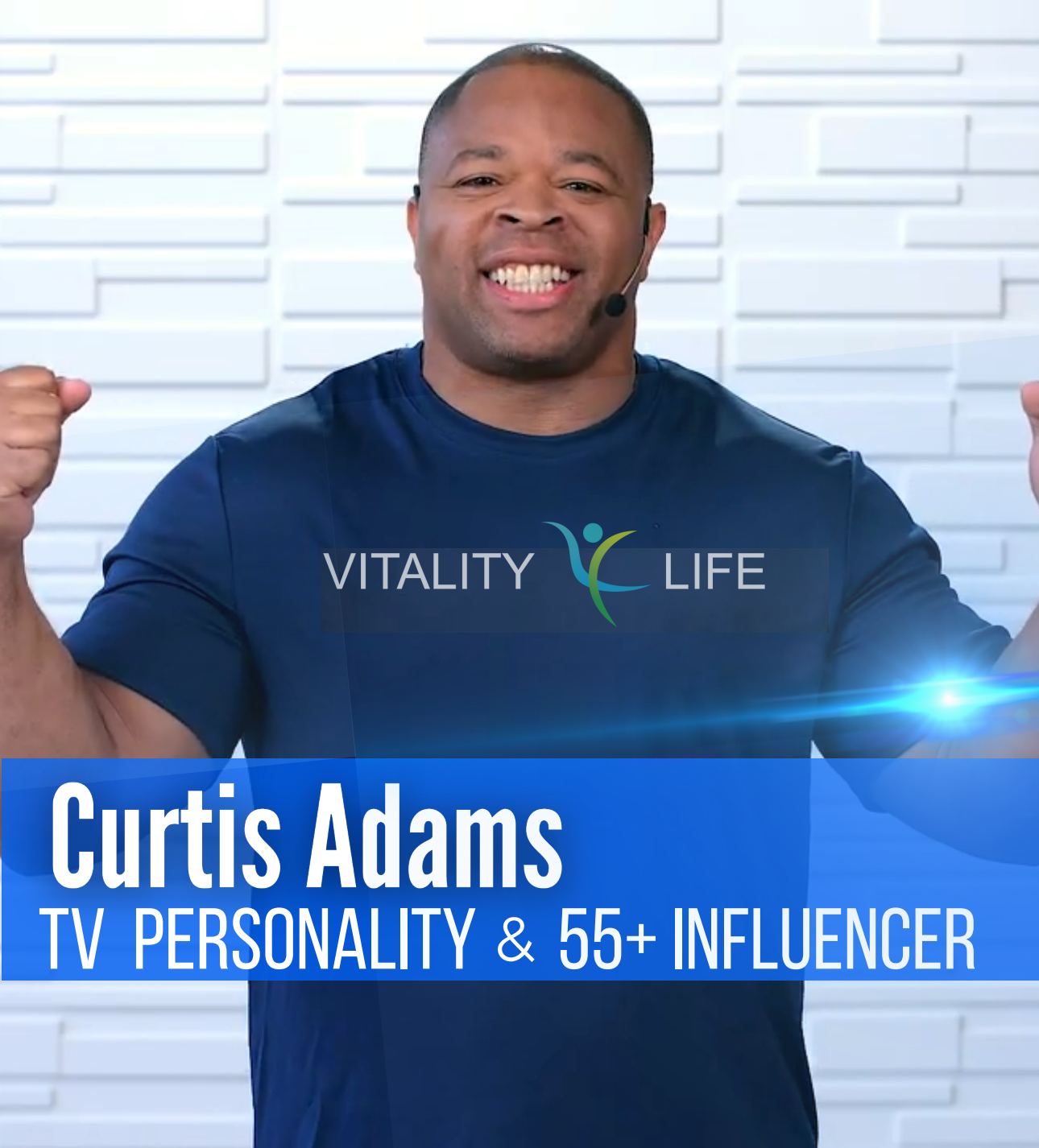
Curtis Adams TV PERSONALITY & 55+ INFLUENCER